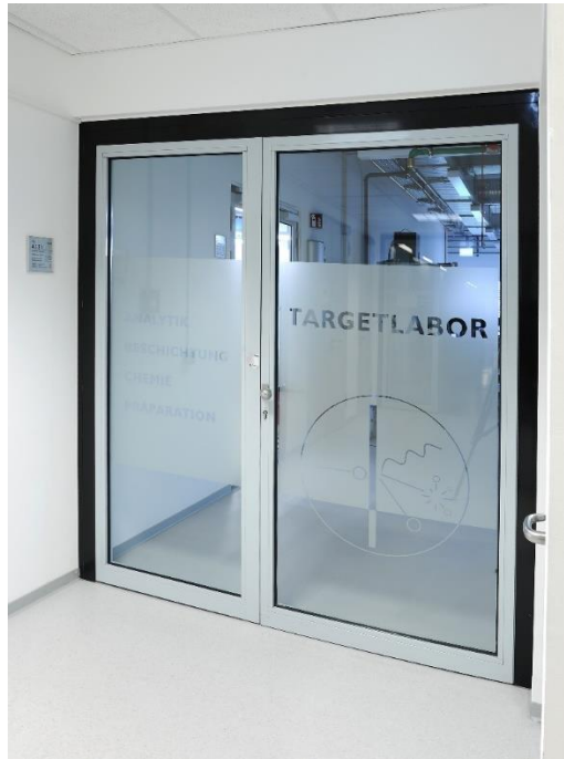
Figure 1: Entrance to the target laboratory.

Since the 1970ies, GSI operates an accelerator facility for fundamental research in nuclear physics, atomic physics, material science, plasma physics, and biology. Most ions from H up to U can be accelerated.