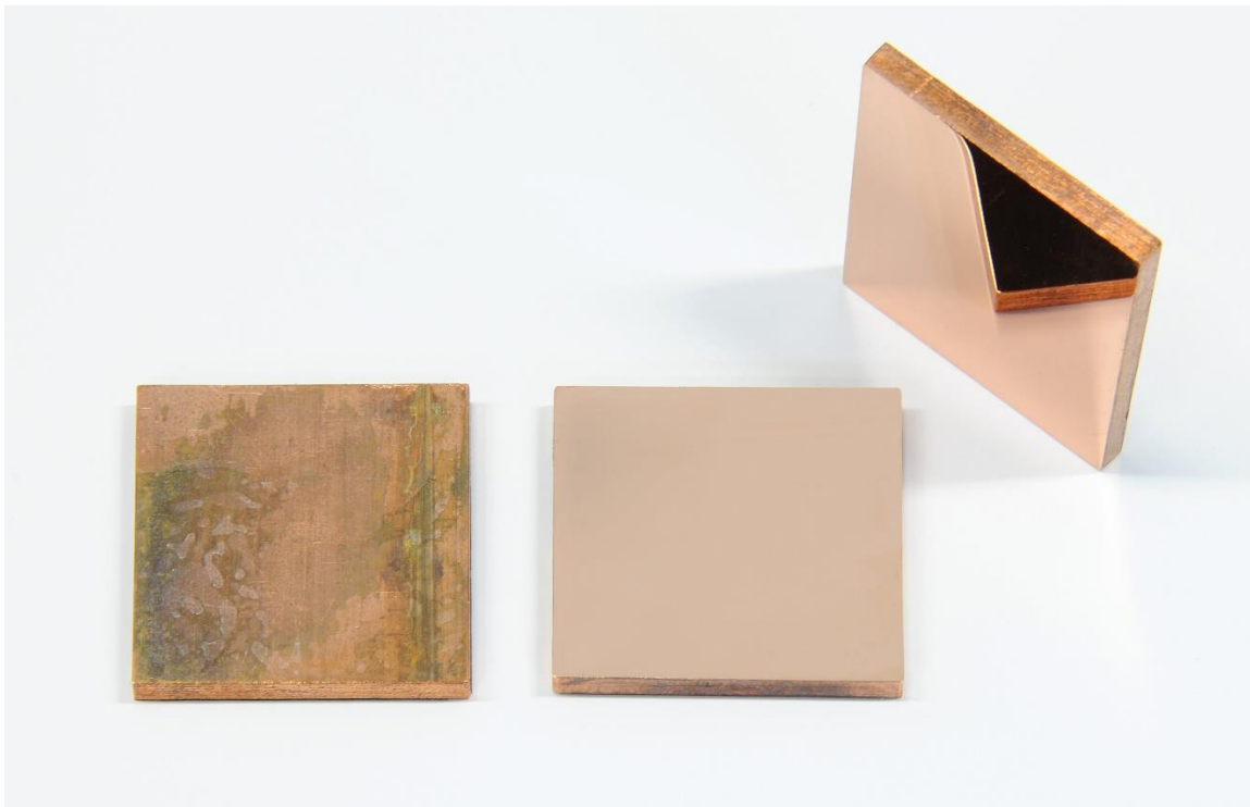
Copper samples as cut, lapped, and polished prepared by Annett Hübner, GSI