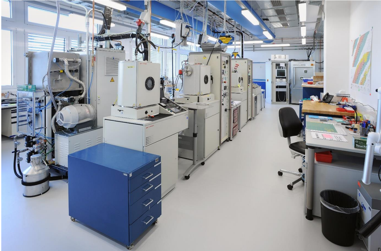
Figure 2: Coating laboratory.

We also produce thicker targets by cold rolling or by lapping and polishing; one nice example of a copper bulk target is displayed in the title photo to this issue. For characterization and documentation, we have a large variety of analytical techniques available as e.g. Scanning Electron Microscopy with Energy-dispersive X-ray Analysis, contact free thickness measurement with chromatic aberration and 3D-Scanning Microscope.